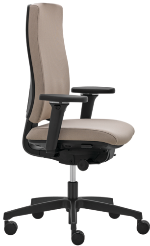
FL 745.089 NPR